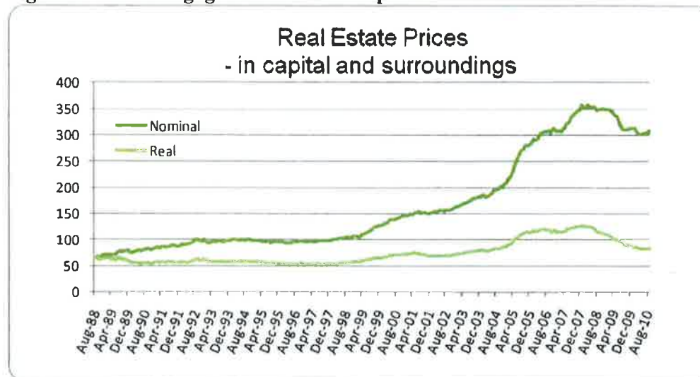
Figure 1: The Mortgage Market - Development

Source: Presentation of the Icelandic authorities in the meeting with the Authority on 7 February 2011 concerning Case No 69464.